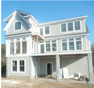
Left: FORTIFIED™ gold standard home, Right: retrofitted FORTIFIED™ Bronze Roof

Two homes in South Kingstown are in the final stages of FORTIFIED HOME™ certification - a newly constructed coastal home built to the Gold standard and an existing home retrofitted with a roof submitted for Bronze certification. The Insurance Institute for Business and Home Safety's FORTIFIED Home™ - Hurricane program helps homeowners strengthen their home against the devastating power of tropical storms and hurricanes. Whether building a new single-family home or updating the resilience of your existing home, using FORTIFIED Home™ - Hurricane will make any home more resilient and durable, and help a homeowner protect what is priceless during a disaster. For more information, check out www.disastersafety.org .